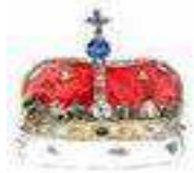
Crown of Life