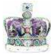
Crown of Righteousness