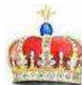
Crown of Glory