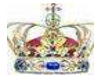
Crown of Rejoicing

The Bible specifically talks about 5 different crowns that will be given to some of God's people when they enter into heaven. These crowns are going to be for work that is done for God that is beyond the normal scope of what the average Christian may attempt to do. These crowns will also be incorruptible and will last for all of eternity. They are the Crowns of Incorruptible, Righteousness, Life, Rejoicing, and Glory.